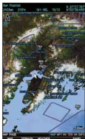
Realistic satellite imagery gives you the "big picture"