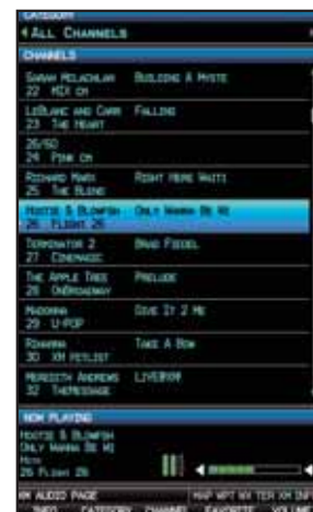
XM Radio support lets you enjoy 170+ audio channels 1