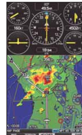
Optional XM WX™ weather can overlay on moving map 1