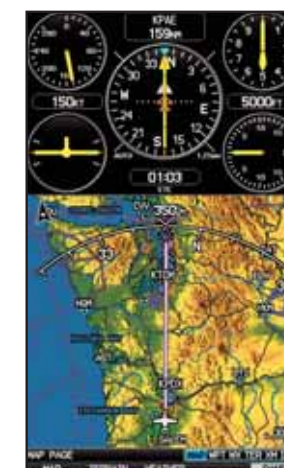
Split-screen combines map with GPS panel display