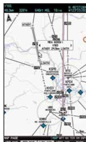
IFR map mode shows high and low enroute airways