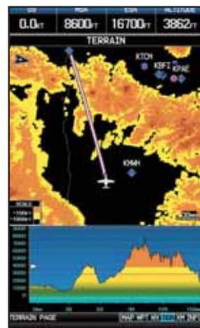
Terrain page offers overhead and vertical profile views

for NEXRAD images and all the other great XM WX™ satellite weather capabilities 1 , including new icing forecast as well as pilot reports. Plus, you can even use the optional XM Radio capability to enjoy 170+ channels of digital music, news and programming through your aircraft headset or cabin audio system 1 . It's never been so easy to get the big picture from a portable. And for operators outside the XM coverage area, Garmin's GPSMAP® 695 model offers similar functionality, without the XM satellite weather/entertainment capabilities.