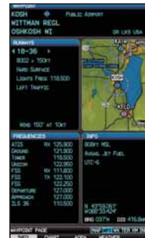
AOPA Airport Directory holds data on 5,300+ U.S. airports