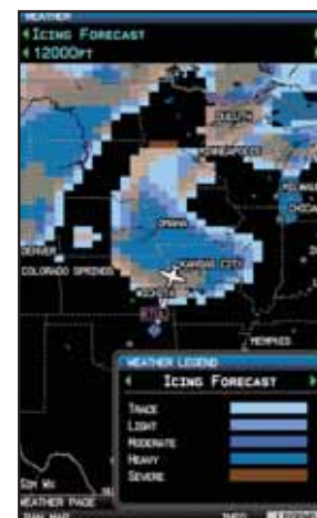
Available XM WX™ data includes potential icing forecasts 1